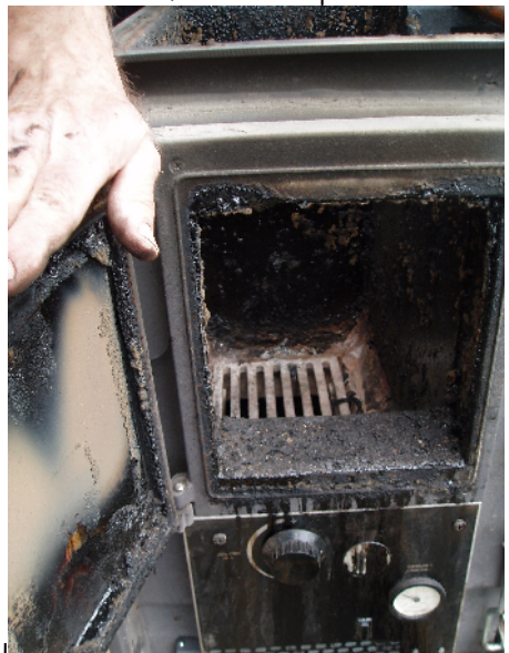
Tar on loading door glass